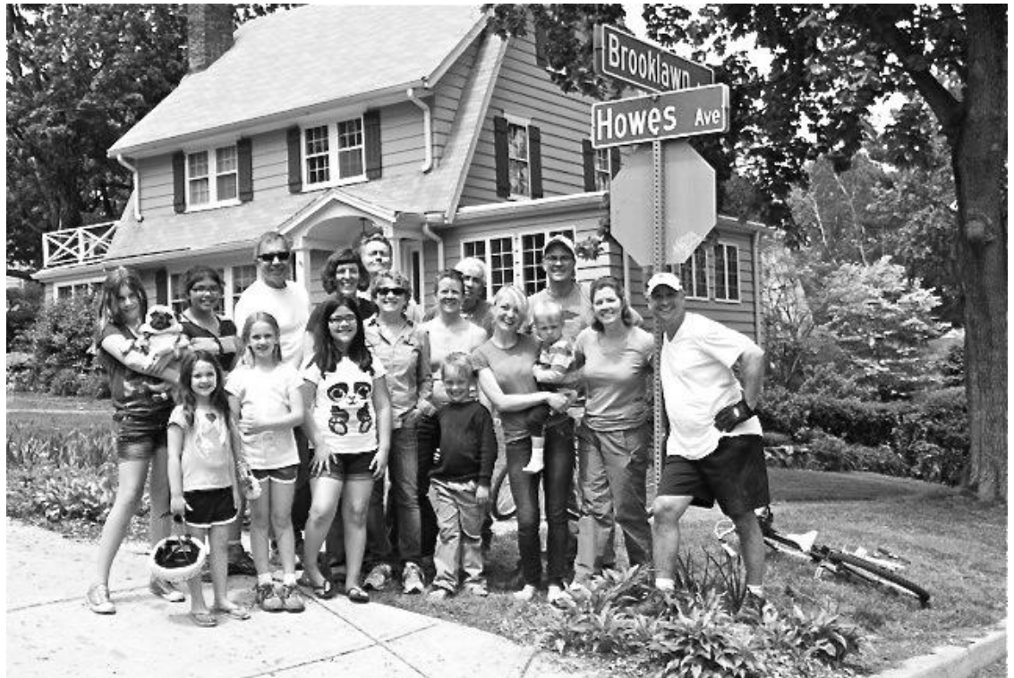
Residents of Howes and Brooklawn Avenues after a day of planting their new street trees

Wells Fargo grant offers the chance to “green up” the neighborhood