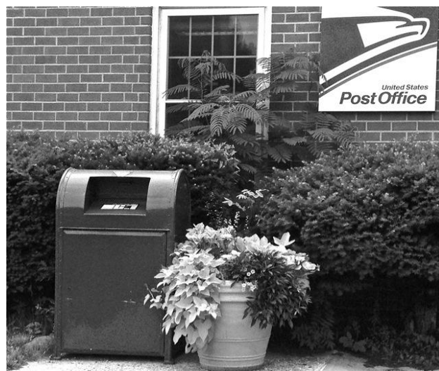
Another beautiful GNA planter—this one's right outside the Glenbrook Post Office

To learn more about what else GNA did this year, turn to the back page!