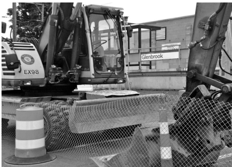
Work on the Glenbrook Station canopy began this past June and is scheduled to be completed in May 2014.